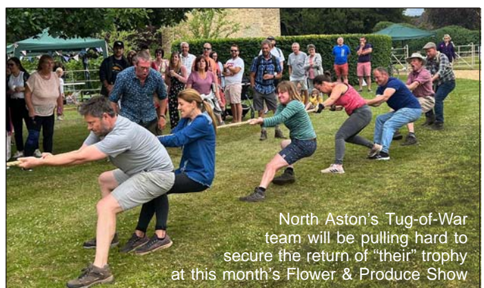
North Aston's Tug-of-War team will be pulling hard to secure the return of "their" trophy at this month's Flower & Produce Show