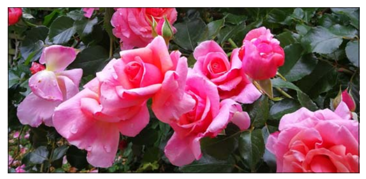
Front cover: The Mikron Theatre Company performed on the Green, on Friday 24th June. Above: It's been a good start for roses!

We are pleased to learn that a Ukrainian family has already been settled into the village, and we look forward to welcoming them in the coming days and weeks.