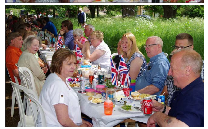
Many thanks to all those who made the Jubilee Celebration Lunch such a huge success last month. Close on 100 residents attended, and the rain held off ... just.