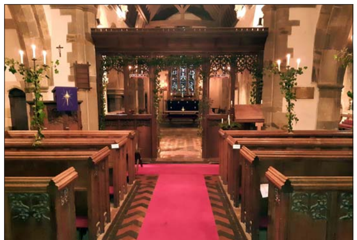
Front Cover: Happy New Year! The Church of St Mary's, with a bit of artistic licence in recognition of the completion of restoration to the clock face on the Elizabeth Tower, Palace of Westminster.

Highly recommended is a Tour & Tasting event at the Cotswolds Distillery in Stourton, near Shipston on Stour. For just £20 per head, you enjoy a guided tour of the distillery followed by a comprehensive and well-instructed tasting session in the distillery's own lounge. There's also an excellent café on site offering lunches and teas. See how whisky and gin are made and then savour the flavour! www.cotswoldsdistillery.com