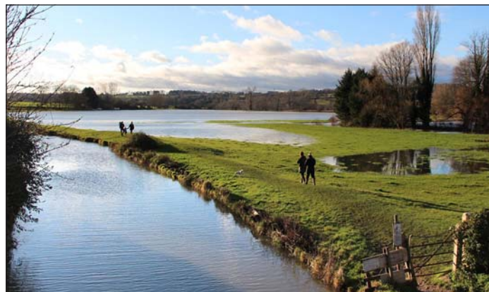
DAVID REED, SOMERTON

On the Tuesday we did the same, but in reverse, stopping to enjoy a hip flask and a smoke for me at the gravel pits. The floods had doubled overnight, making for good views, with lots of geese and ducks.